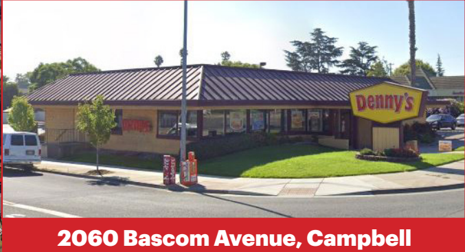
2060 Bascom Avenue, Campbell