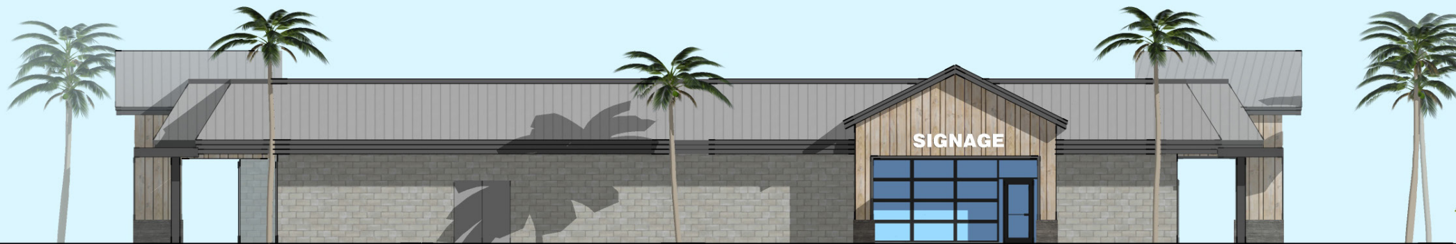
4850 Hollister Ave - East Elevation