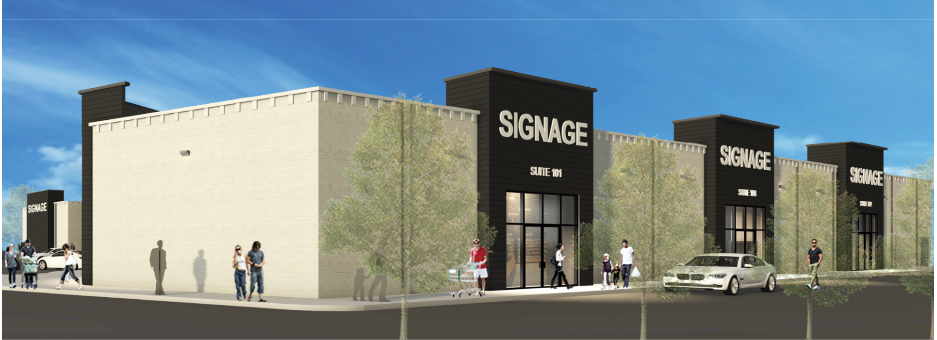
CONCEPTUAL PERSPECTIVE (FACING SOUTH) SCALE: NTS