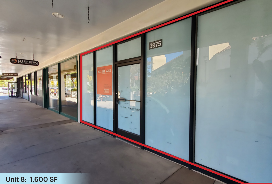
Unit 8: 1,600 SF