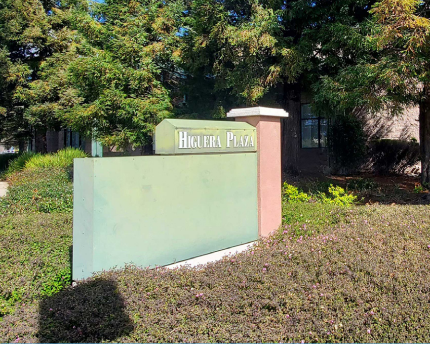
Exclusive Corner Signage