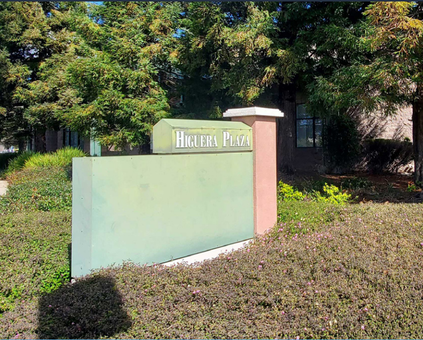
Exclusive Corner Signage