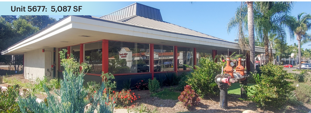
Unit 5677: 5,087 SF