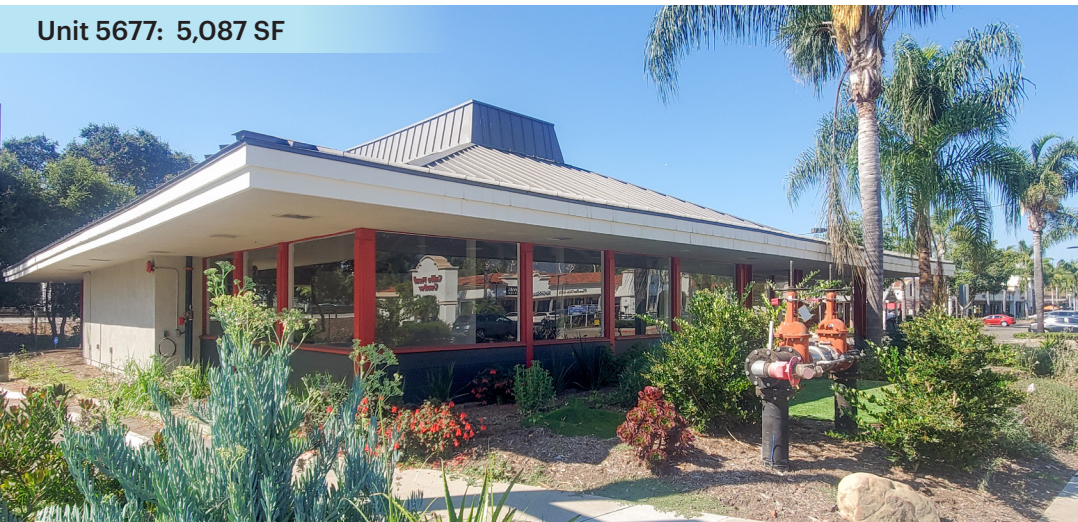
Unit 5677: 5,087 SF