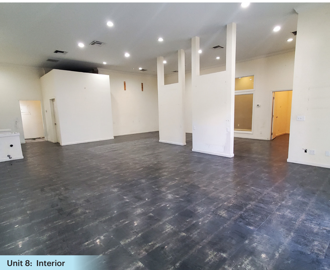
Unit 8: 1,600 SF

Five Points Shopping Center is located within the hub of Santa Barbara’s daily needs retail corridor, at State St. and La Cumbre Rd. Often described as the trade area’s dominant grocery-anchored center, this 144,573 SF property is visible from Highway 101 and adjacent to La Cumbre Plaza. Co-tenants include Smart & Final, Ross, CVS, Petco, Starbucks, and more.