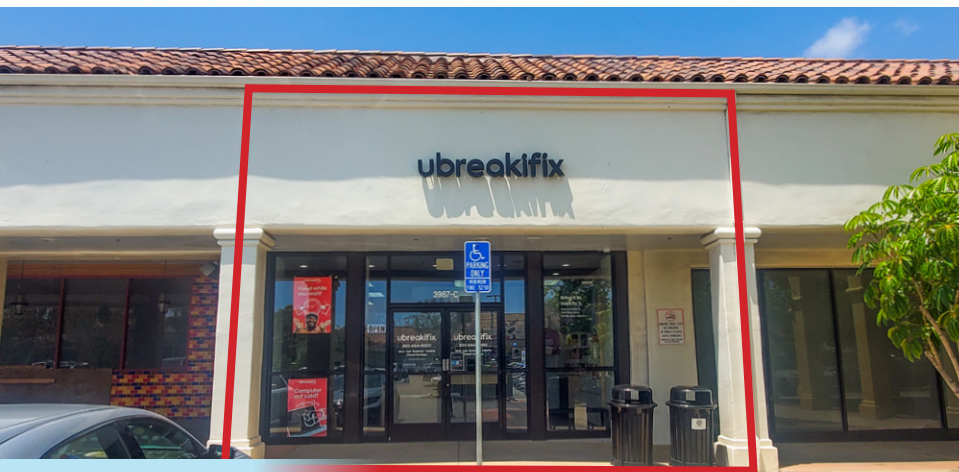
Unit 21: ±890 SF