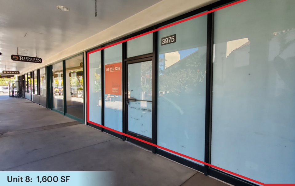
Unit 8: 1,600 SF

Five Points Shopping Center is located within the hub of Santa Barbara’s daily needs retail corridor, at State St. and La Cumbre Rd. Often described as the trade area’s dominant grocery-anchored center, this 144,573 SF property is visible from Highway 101 and adjacent to La Cumbre Plaza. Co-tenants include Smart & Final, Ross, CVS, Petco, Starbucks, and more.