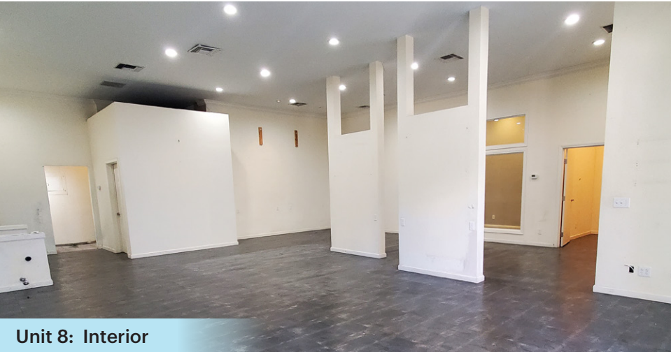
Unit 8: Interior