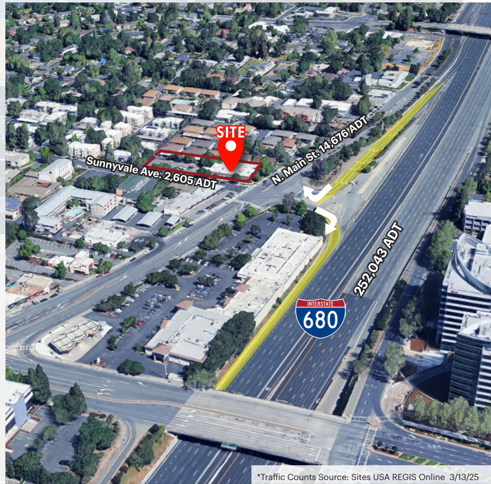
*Traffic Counts Source: Sites USA REGIS Online 3/13/25