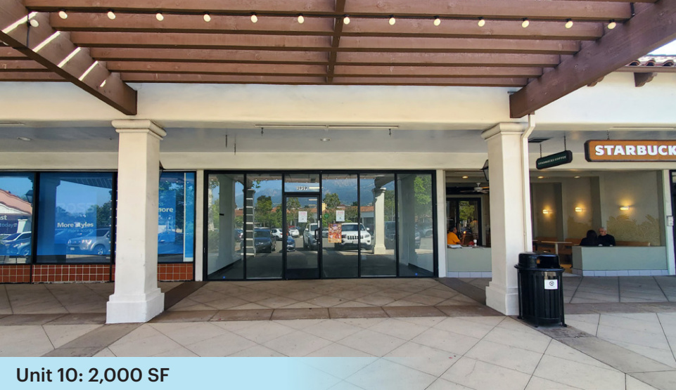
Unit 10: 2,000 SF

Five Points Shopping Center is located within the hub of Santa Barbara’s daily needs retail corridor, at State St. and La Cumbre Rd. Often described as the trade area’s dominant grocery-anchored center, this 144,573 SF property is visible from Highway 101 and adjacent to La Cumbre Plaza. Co-tenants include Smart & Final, Ross, CVS, Petco, Starbucks, and more.