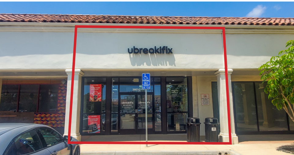
Unit 21: ±890 SF