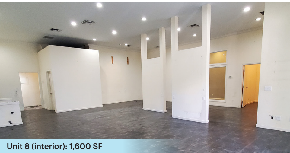
Unit 8 (interior): 1,600 SF