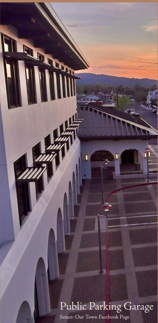
Public Parking Garage

The property is supported by ample nearby public parking, including convenient street parking along Oak Street and First Street, as well as additional municipal parking options within close proximity. There is no dedicated on-site parking.